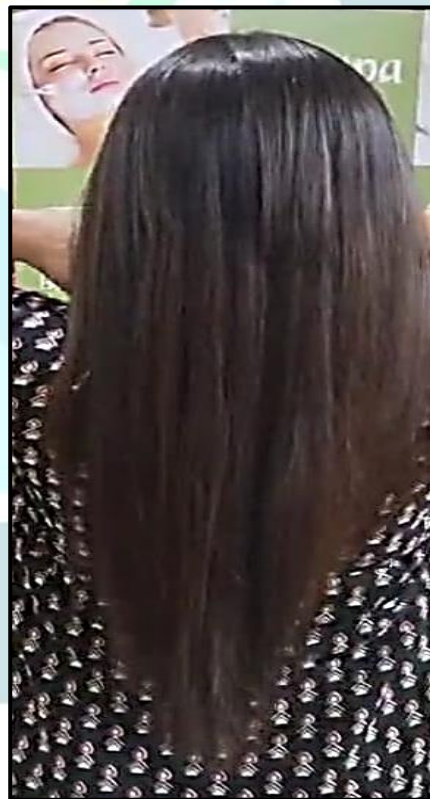
After HAIRONIX-I treatment